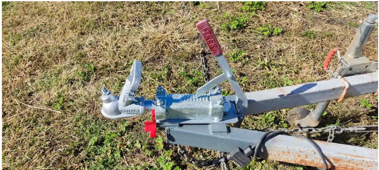
Figure 2- Handbrake applied to trailer