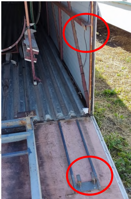
Figure 4- stop and lateral support