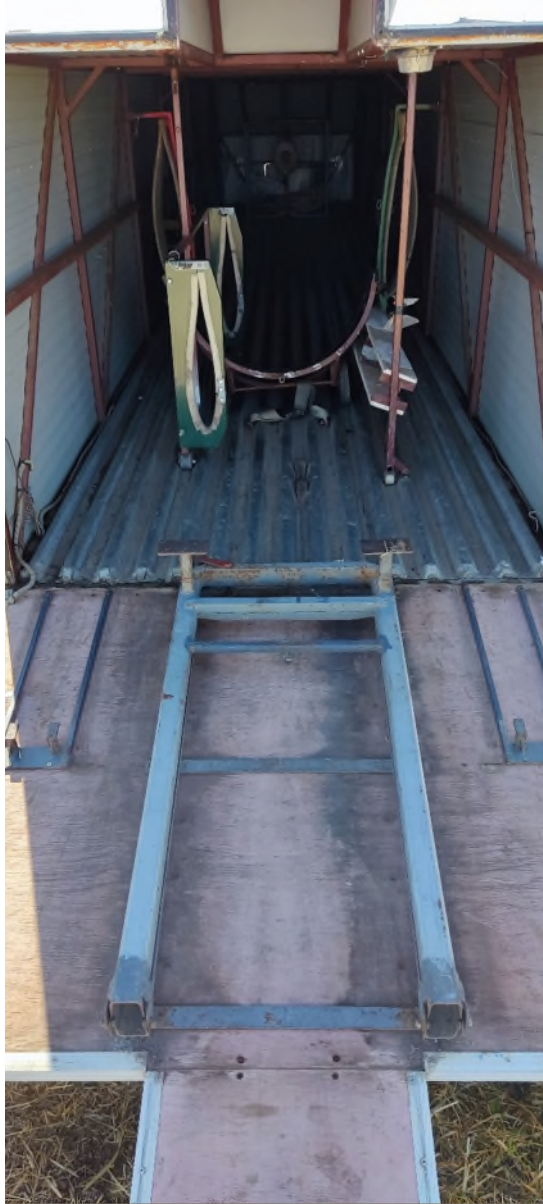
Figure 3- correctly stowed empty trailer