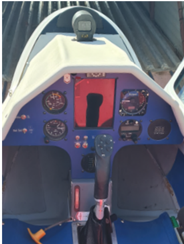
Figure 1- Instrument panel